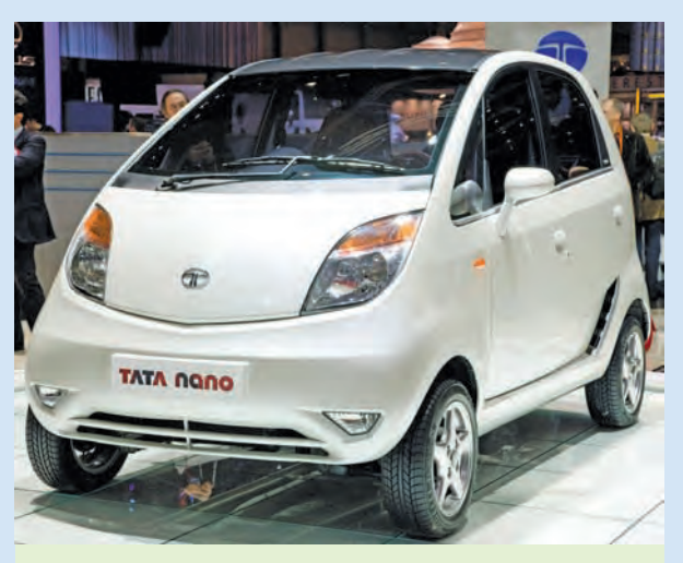
Tata Nano European launch at a Motor Show 2008

Tata Motors has some distinct advantages in comparison to other MNC competitors. There is a definite cost advantage as labour cost is 8-9 per cent of sales as against 30-35 per cent of sales in developed economies.