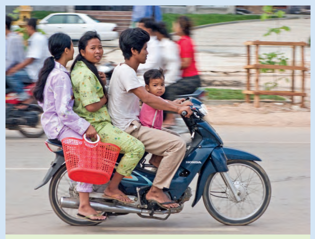
The alternative for Tata Nano

Tata Nano started with the vision of Ratan Tata, chairman of Tata Motors' parent, Tata Group, to create an ultra-low-cost car for a new category of Indian consumer: someone who couldn't afford the $5,000 sticker price of what was then the cheapest car on the market and instead drove his family around on a $1,000 motorcycle. Many drivers in India can only afford motorcycles and it is fairly common to see an Indian family of four on a motorcycle.